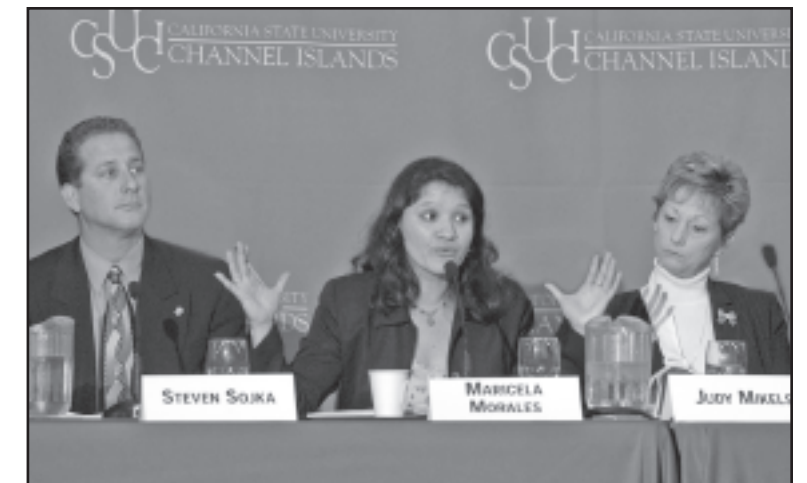
Community leaders discuss growth and sustainability strategies proposed by the Civic Alliance at The Road Ahead 2 conference.

More than 300 people attended “The Road Ahead 2,” the second annual growth conference sponsored by the Ventura County Civic Alliance; California State University, Channel Islands; and the Ventura County Star . The purpose of the conference was to propose strategies to address the challenges that lie ahead, building on last year's successful conference.