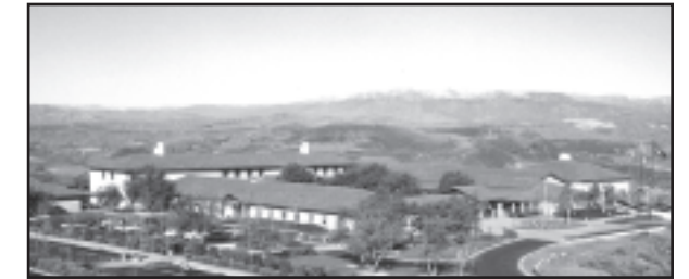
The Ronald Reagan Presidential Foundation is one of the ten largest nonprofit organizations in Ventura County. It sustains the Ronald Reagan Presidential Library and Museum (above) in Simi Valley.